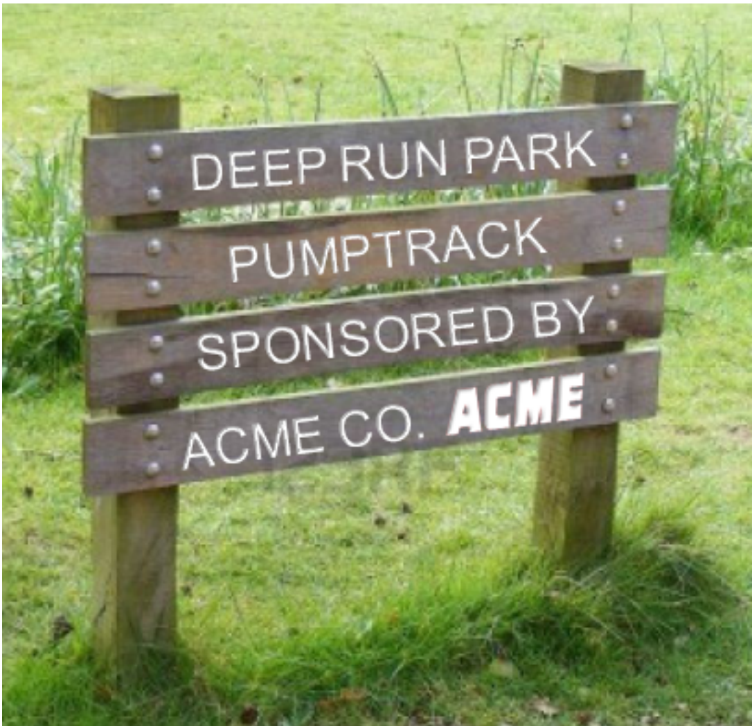
Primary Sign - Track Entrance