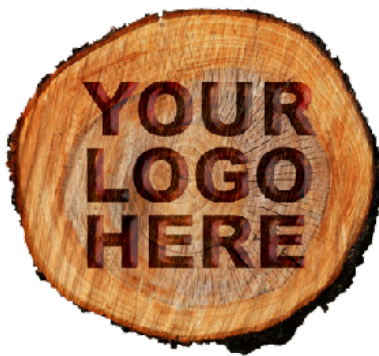
6x6 Custom Placard - Next to Trail entrance